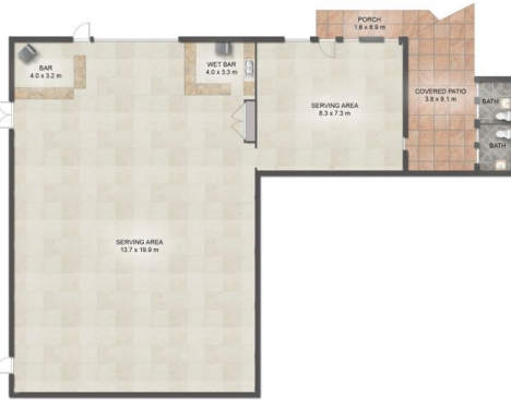
FUNCTION SHED FLOOR PLAN (NOT IN POSITION)