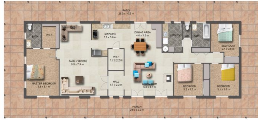
RESIDENCE FLOOR PLAN (NOT IN POSITION)