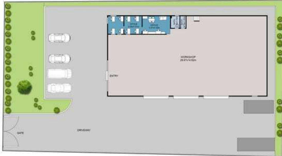
FLOOR PLAN ON SITE