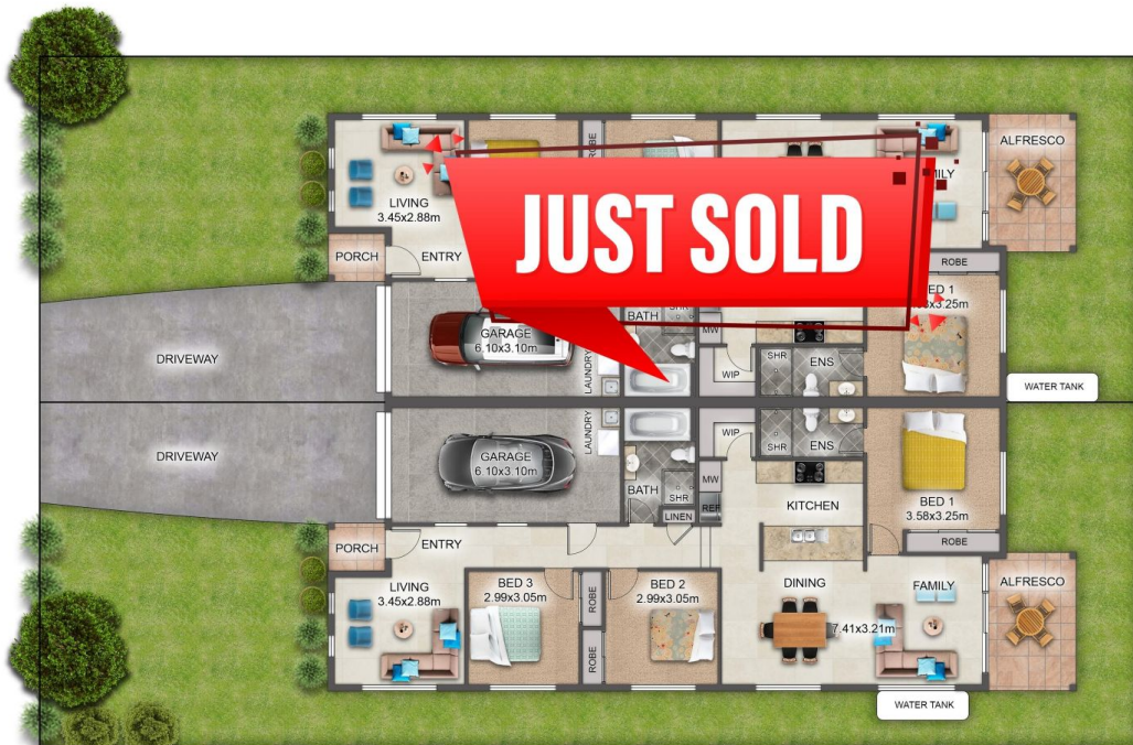
FLOOR PLAN ON SITE

This floor plan including furniture, fixture measurements and dimensions are approximate and for illustrative purposes only. BoxBrownie.com gives no guarantee, warranty or representation as to the accuracy and layout. All enquiries must be directed to the agent, vendor or party representing this floor plan.