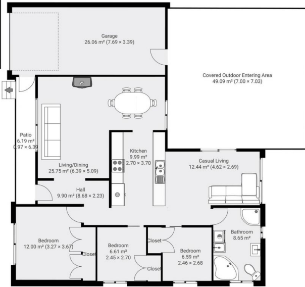
Home Internal Area 95m 2