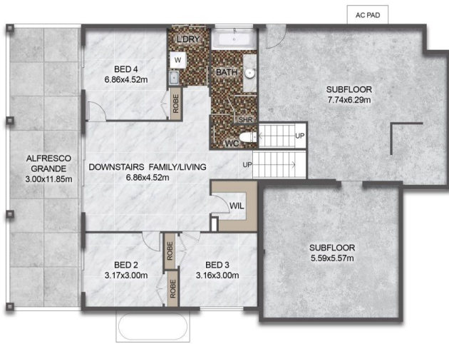
BOTTOM LEVEL FLOOR PLAN