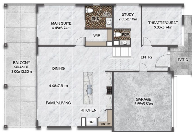
TOP LEVEL FLOOR PLAN

This floor plan including furniture, fixture measurements and dimensions are approximate and for illustrative purposes only. Boxbrownie.com gives no guarantee, warranty or representation as to the accuracy and layout. All enquiries must be directed to the agent, vendor or party representing this floor plan.